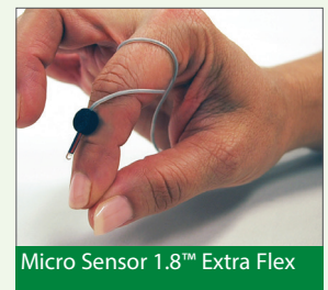
Micro Sensor 1.8™ Extra Flex