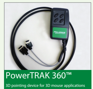
PowerTRAK 360™ 3D pointing device for 3D mouse applications