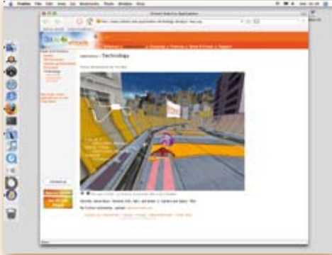
The 3DVIA player

These solutions deliver not only the high-quality graphics found in cutting-edge 3D games, but also provide the advanced behavioral interactivity that can be found in bestsellers.