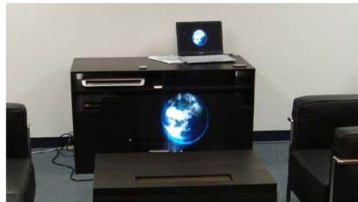
(above)heliodisplay integrated into slot in a coffee table

Heliodisplays are free-space displays capable of reproducing full color video and images into mid air. No surface is necessary. Various models are available ranging in size from a 30" diagonal, to a 100" image, in standard 4:3 aspect ratio (as on a standard TV). Similarly, they plug into a computer or DVD player using a standard computer, or video cable and similar power plug.