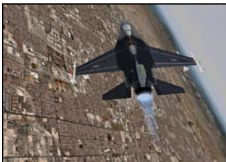
Multi-display mission critical visual simulation solution by Aechelon with NVIDIA Quadro Plex.