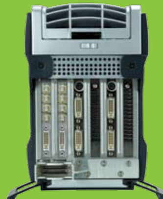
NVIDIA Quadro Plex 1000 Model III