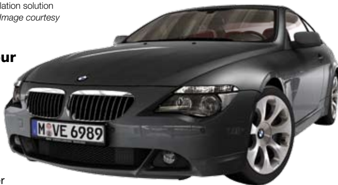
Photo-realistic, interactive automotive styling design driven by NVIDIA Quadro Plex.

NVIDIA Quadro Plex 1000 enables the highest density SLI multi-GPU capability on any PCI Express x16 platform and is built on a foundation of proven NVIDIA Quadro graphics and NVIDIA Unified Driver Architecture (UDA).