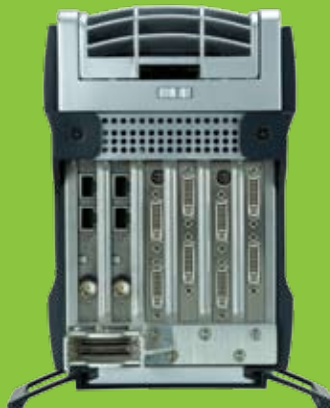
NVIDIA Quadro Plex 1000 Model II