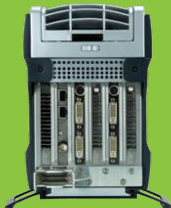
NVIDIA Quadro Plex 1000 Model I